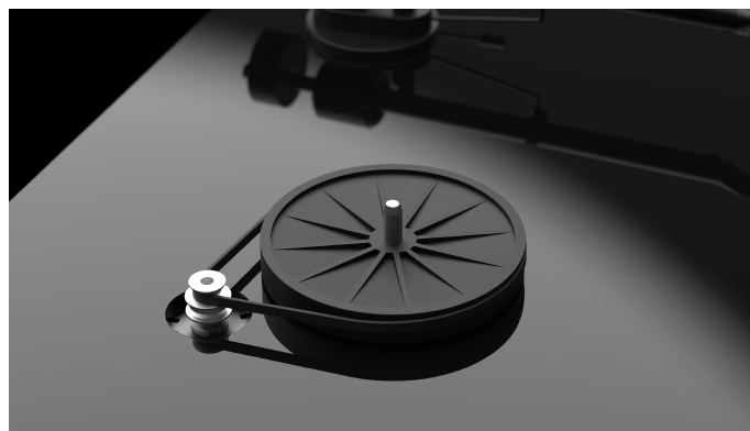
Ultra-precise electronically regulated motor Immaculate speed stability and accuracy

In the T1-line, the motor drives a belt-system, attached to a newly designed sub-platter, which is mounted into an ultra-precise 0.001mm main bearing with a hardened steel axle and brass bushing – just like our coveted Essential III turntables. Alongside the chosen motor system, the T1 is therefore able to ensure a smooth, anti-resonant rotational platform for the tonearm and cartridge to ride across.