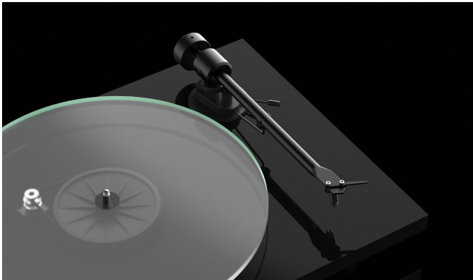
One-piece aluminium tonearm Robust and stiff construction for pure sound fidelity

Supplied with an Ortofon Moving Magnet cartridge, featuring an elliptical diamond stylus tip; this is a true hi-fi playback system with no corners cut.