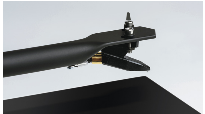
High-quality Ortofon Moving Magnet cartridge with elliptical stylus tip

The T1 Phono SB is then finished with super shielded, semi-symmetrical, low-capacitance phono cables, purpose-designed by Pro-Ject – not off-the shelf RCA cables. There is also a dust cover for extra protection and a felt mat to protect your records.