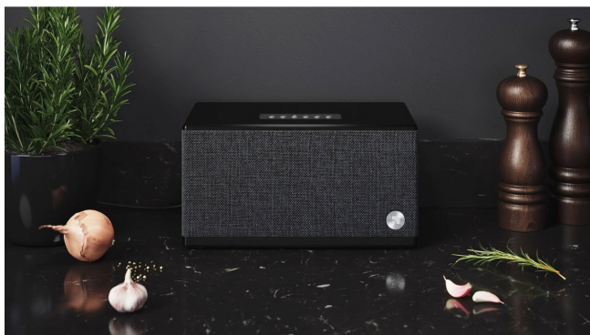
Accessories are rare: a power cable and that's it ... not even a 3.5 mm jack cable

Most audio players are fortunately there to adjust the sound to your liking. On other models of the brand, the treble tends to be a little too present: the disappearance of a tweeter may have something to do with it, but this is not the case on the BT5. Midrange and treble seemed to be well balanced. There may be some limitations on some high-end instruments such as the cymbals which tend to be a bit metallic while the vocals may slightly hiss. Make no mistake, here we are looking for the little beast to justify the price difference that may exist between this BT5 at more or less 160 - 170 euros and the Audio Pro Addon C5 for example which is negotiated 30 euros more. In general, the BT5 made a very good impression on us.