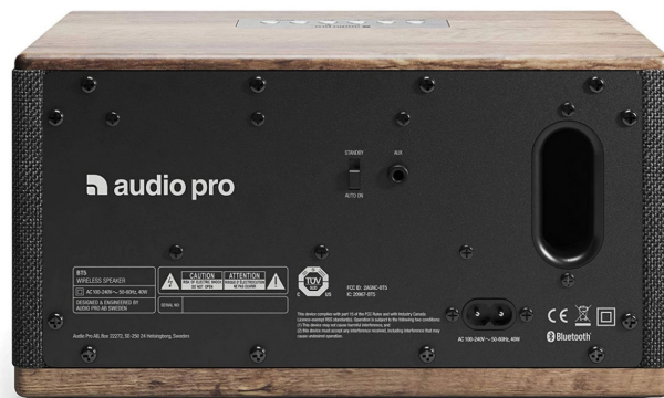
The rear is very sober

The entire structure of the speaker is made of wood, but Audio Pro has chosen to cover most of it with gray striped fabric on all finishes. This coating contributes to the vintage look of the BT5 and gives it an undeniable cachet. The fabric can also hide the speakers, but this is a matter of taste: some prefer the old Audio Pro style, when the speakers were clearly visible. Audio Pro has also chosen to reduce the airfoil compared to its previous models by integrating only one 6" tweeter to accompany a woofer slightly more imposing than on the Addon T3 for example: 4" against 3, 5" on the previous speaker.