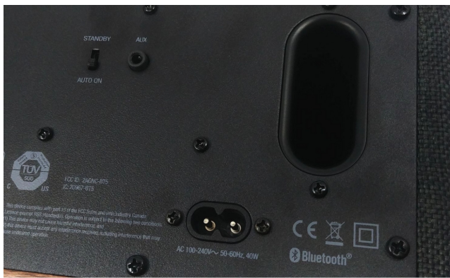
Zoom on the (rare) connectors and the rear vent