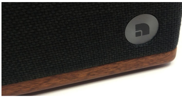
A discreet logo on the front