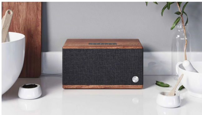
Integration into Scandinavian fashion

Its architecture very close to other Audio Pro speakers suggests an interesting audio behavior for this B5. First, let us emphasize the good reserve of power which we have without distorting the sound. We also benefit from an extended frequency response, in accordance with the promise established on the technical sheet of the speaker with bass that actually starts around 50 Hz. In general, the sound is pleasant without being too colorful. We appreciate its precision and respect for "natural" sounds. Given the relatively large volume of the BT5 and its architecture, we are not surprised to have low frequencies more particularly in the spotlight.