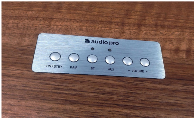
Orders a little too stripped down

Bluetooth speaker, the BT5 is obviously to be connected through this protocol so appreciated by smartphone holders. Alas and while it is however fashionable among the vast majority of manufacturers - even on much less expensive models - Audio Pro does not have any application to manage its speaker. The pairing is therefore done from the mobile - or the tablet - without it being then possible to take advantage of any "expert" mode with settings in all directions: you will have to do with what your mobile offers and / or your favorite audio player. Undoubtedly disappointing, even if neophytes will no doubt be delighted to have a very simple product without the risk of planting anything.